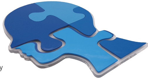
Multi-color painted flat cut acrylic

Great signage solutions come from continued partnership between Gemini and their customers. This project showcases the creative ability of Gemini's layout team, as well as their willingness to problem solve with customers to find solutions that achieve the desired end result. Without this collaboration, it may have been more challenging to produce the same high-quality product for the surgeon's clinic.