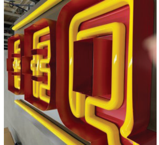
Gemini Faux Neon Letters

Initial designs featured the word "BAR" for one sign and "BBQ" for the other, to be mounted on either side of the current sign. While the project was in its initial stages, a sales representative from Gemini made a site visit to SIGNLite to share some of the latest products. Included in their material samples was an example of faux neon. This product uses LED lights to create a glow like that of neon lighting.