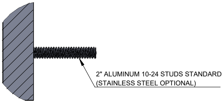
DETAIL DW II SCALE 1 : 1