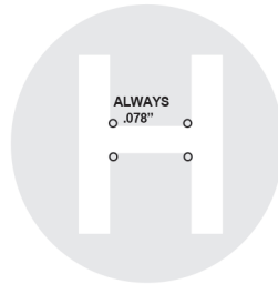
Inside of acrylic insert .078"